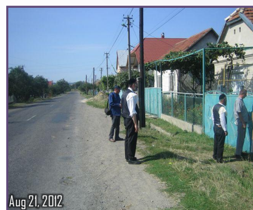
Szentmiklos: During negotiations