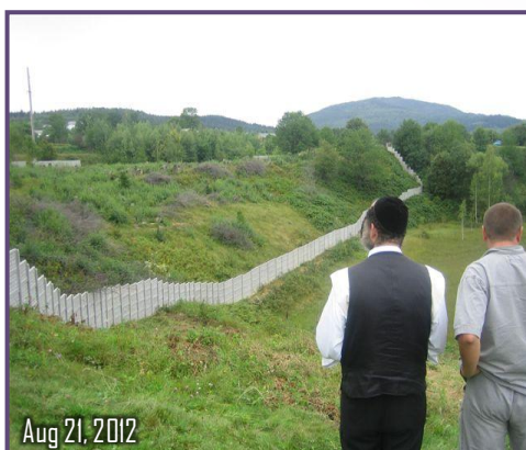
Delyatin: Contractor and agent at cemetery.