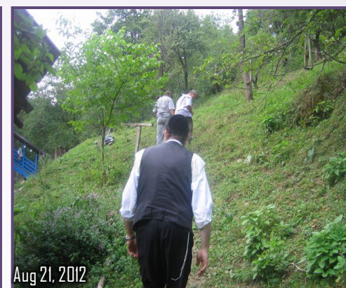
Rachov: Agents study complex strategy for restoration